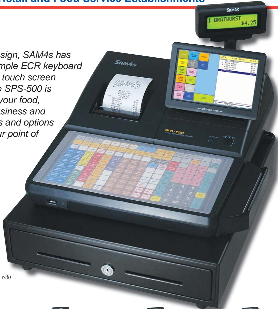
SPS-500 Series Hybrid ECRs Shown with Optional Card Reader

Featuring a hybrid design, SAM4s has combined fast and simple ECR keyboard entry with an intuitive touch screen operator display. The SPS-500 is easily configured for your food, beverage, or retail business and provides the functions and options you need to meet your point of service needs.